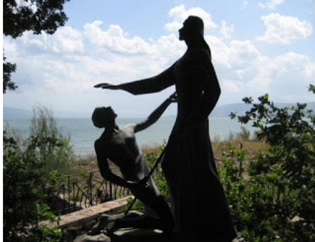
A statue by the Sea of Galilee commemorating Jesus sending Peter to "feed my sheep."