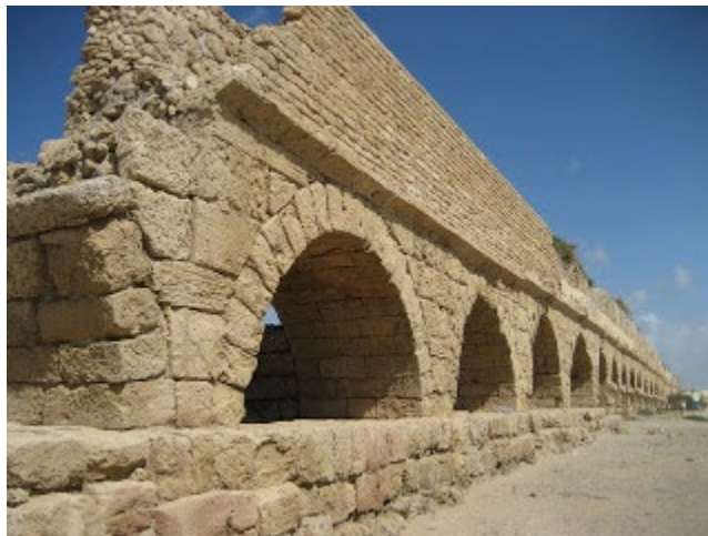
The aqueduct at Caesarea Maritima by the Mediterranean Sea.