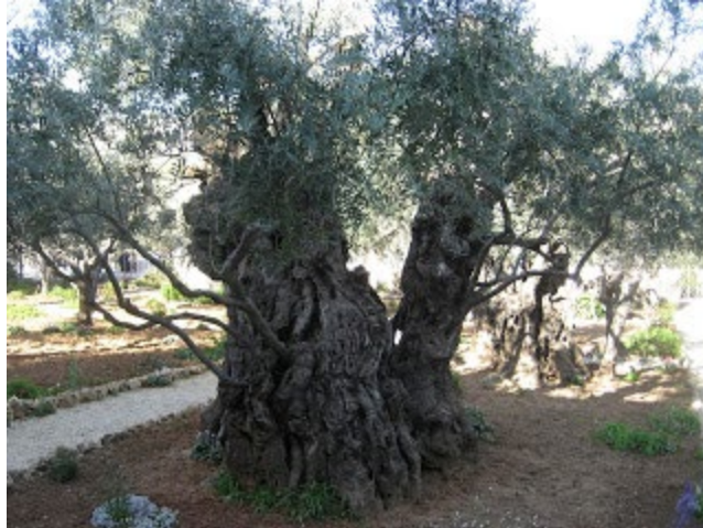
1500 year old olive trees grown from the shoots of olive trees that stood in the Garden of Gethsemane when Jesus prayed there.